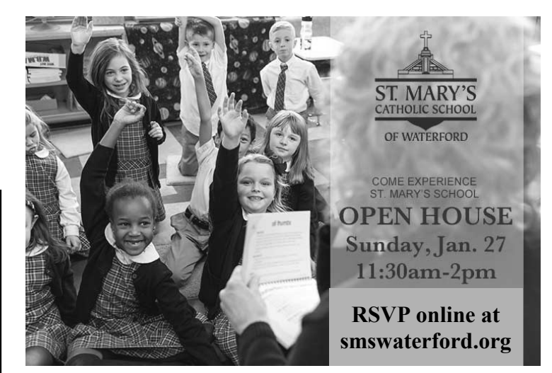
EXPERIENCE OUR COMMUNITY OF FAITH, TRADITION AND EXCELLENCE

We invite you to visit St. Mary's School to learn more about our community and programs