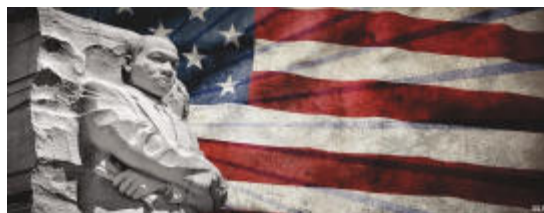
Dr. Martin Luther King Day Jan. 17